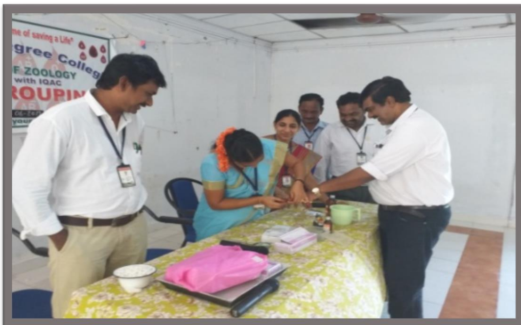
Blood Group Testing to Faculty