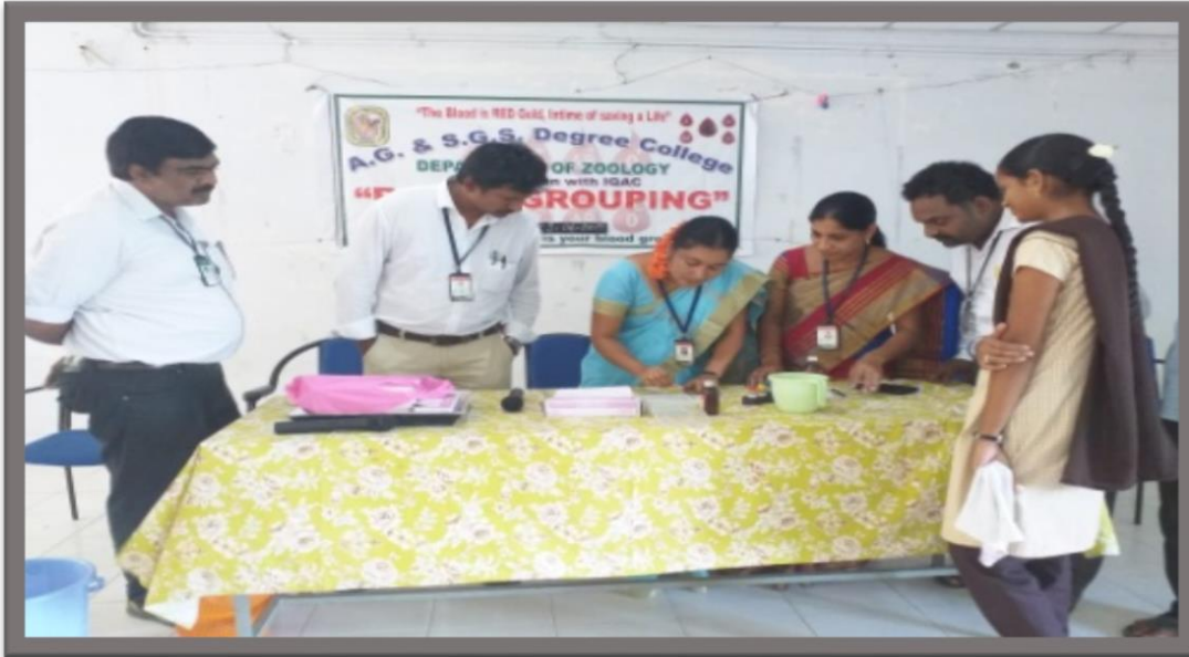
Zoology Faculty conducting Blood Group Testing