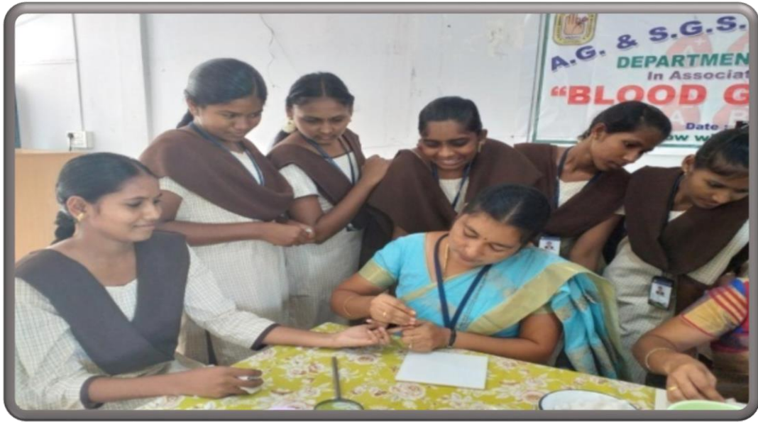
Blood Group Testing to students