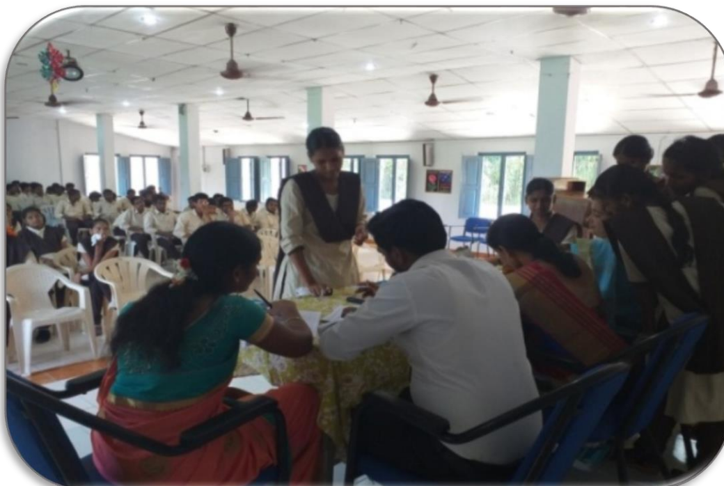
Zoology Department conducting Blood Group Testing in Seminar Hall